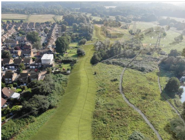
Visualisation of Common Meadows

During the appraisal phase we investigated options for installing a fish pass at Broadoak Weir. However, to avoid delays to the Sanway-Byfleet FAS we are currently considering the fish pass as a separate project.