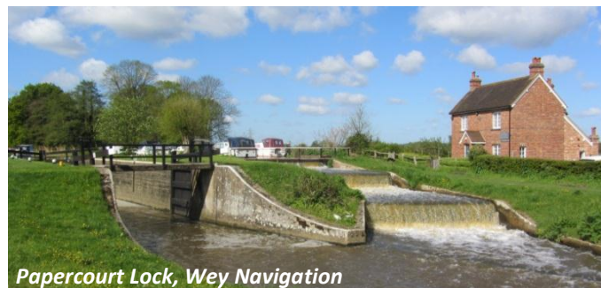
Papercourt Lock, Wey Navigation

Crossing the stiles, you will enter the 19 hectare Papercourt Meadow, a Site of Special Scientific Interest managed by Surrey Wildlife Trust. BE WARNED – this section can be very wet underfoot. This important habitat is home to a wide variety of birds including stone chats, marsh harriers and short-eared owls. You may also see the Trust's herd of belted galloway cattle, recently re-introduced to graze the meadow. Continue on to Papercourt Lock and cross two bridges, firstly Broadmead Cut and then the Wey Navigation itself. This is a fine spot from which to admire a waterway built over 350 years ago. Construction of the 15-mile route between Guildford and the Thames began in 1651 and only took 2-3 years to complete. Today the navigation is owned by the National Trust.