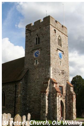
St Peter's Church, Old Woking

Just before you reach this point take a moment to enjoy the fine panoramic views to the south and east. If the weather is clear (and you have binoculars...) on the eastern horizon you may spot the gothic tower at Painshill Park, a folly built in the 1750's, or perhaps the semaphore mast atop Chatley Heath Tower. This was part of the Admiralty's semaphore chain linking London and Portsmouth during the early 19 th century. 13 km to the south-east, high up on the North Downs, is the lofty spire of St Barnabas Church at Ranmore Common. Built in 1859, the church sits at 185 m above sea level.